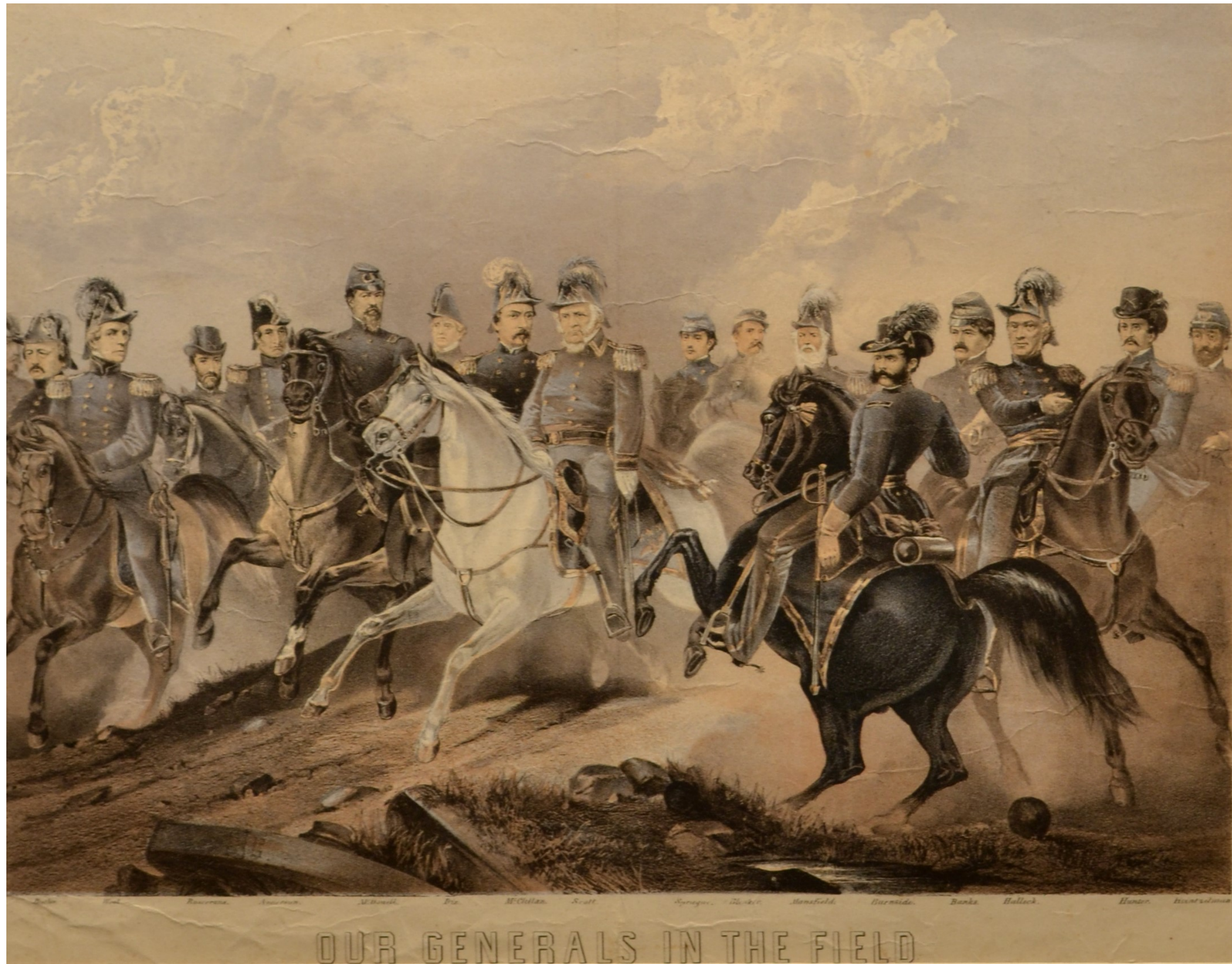
OUR GENERALS IN THE FIELD