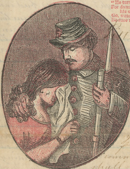
THE GIRL I LEFT BEHIND ME.